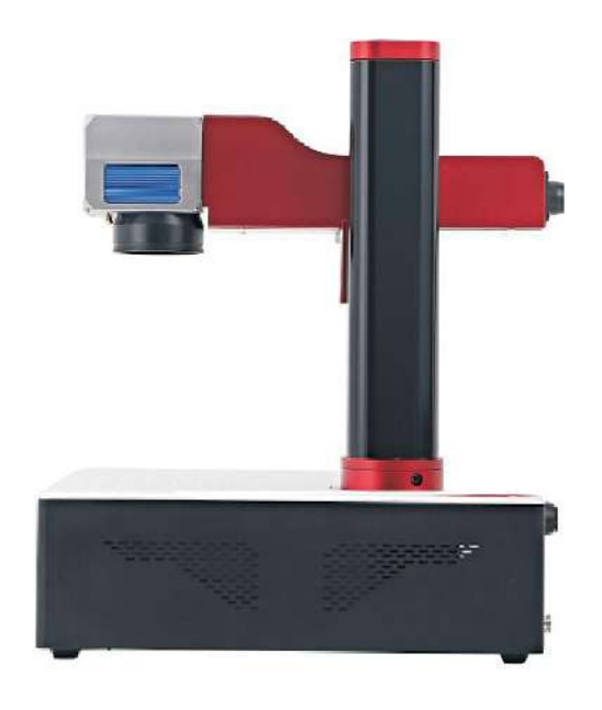
450 * 330 * 570 mm Weight: 20KG

8. Multiple fonts: common 1 D barcode and Datamatrix PDF417barcode